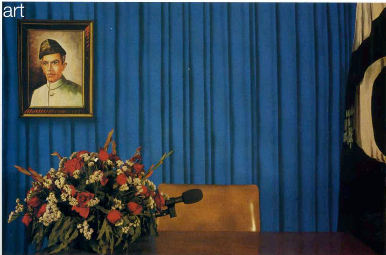
'The Address' Bani Abidi, 2007 Courtesy Green Cardamom